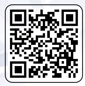
Scan or Visit at: https://visionias.in/current-affairs/